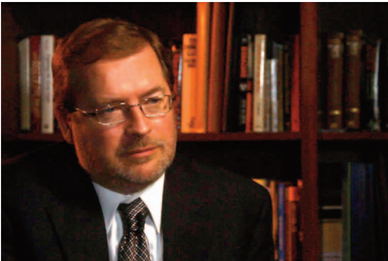
Grover Norquist Washington, DC